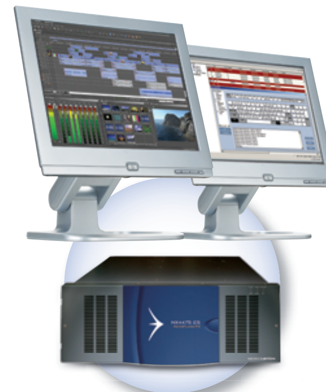
NX4475 ES NEWSFLASH FX